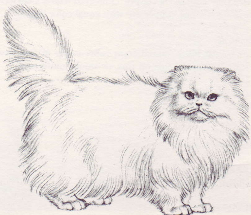
Body: cobby type, low on the legs

Of cobby type, low on the legs, deep in the chest, equally massive across shoulders and rump, with a short, well-rounded middle piece. Large or medium in size. Quality the determining consideration, rather than size.